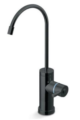
Black Model: DFBB