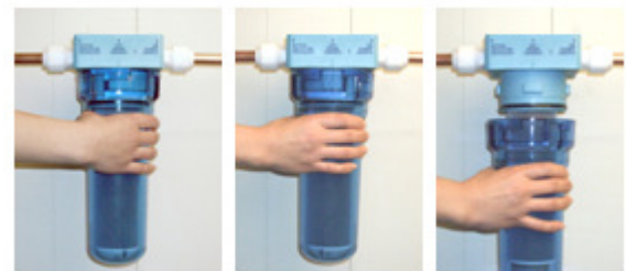
Easy Open Housings - Just grab by hand, turn and remove. No tools required!