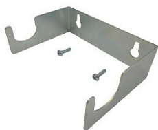
1504 Mounting Bracket